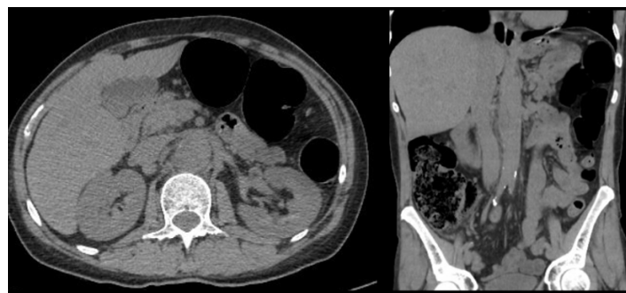
Figure 1. Computed tomography at admission

Pararenal aorta with slight dilatation can be noted in the axial (left) and coronal (right) planes