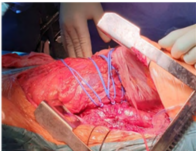
Figure 3. Intraoperative image before aortic reconstruction.

The mycotic aneurysm can be noted. Visceral arteries are referenced with vessel loops.