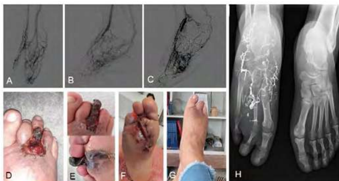
Figure 3. Yakes type IV arteriovenous malformation (AVM) of the foot

A) pre-treatment angiography; inflow through anterior and posterior tibial arteries branches; B) angiography after transarterial coil obliteration and Onyx18® embolization of plantar inflow branches, through posterior tibial artery and great saphenous vein sclerosis with polidocanol foam (3%); C) angiography after direct nidus Onyx18® injection followed by embolization of posterior tibial artery plantar branches and distal pedal artery obliteration, both with Onyx18®; D) clinical presentation with toe painful ulcer; E) toe necrosis after the last embolization treatment; F) atypical transmetatarsic toe amputation and residual AVM excision; G) Completely healed and functional stump with resolution of pain complaints; H) post-amputation X-Ray