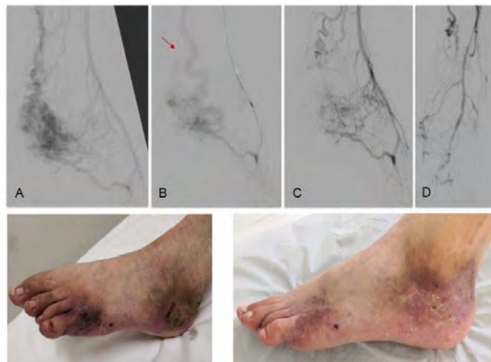
Figure 2. Yakes type IV arteriovenous malformation (AVM) of the foot

A) pre-treatment angiography, inflow through branches from the posterior tibial, peroneal and pedal arteries; B) angiography after transarterial nidus embolization with polidocanol (3%) foam and posterior tibial artery obliteration with Concerto® 4x100 microcoil (arrow) and Onyx34®; nidus access was not compromised given the additional afference by peroneal and pedal arteries' branches; C and D) angiographic result after transvenous sclerosis with polidocanol (3%) foam of the efferent anterior tibial vein (C) and transarterial nidus embolization nidus with PHIL® 30% via peroneal artery (D), performed during the same procedure; E) pre-treatment clinical findings with painful foot ulceration; F) healing ulcerations after last treatment.