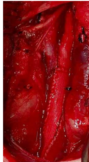
Figure 2. Intra-operative image

Left common and internal carotid artery endarterectomy with a Dacron patch angioplasty.