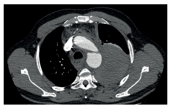
Figure 1 Admission angio CT demonstrating a contained rupture at the aortic isthmus with associated left haemothorax

A 53-year-old male hypertensive, active smoker patient was transferred from another Institution due to an acute non-A-non-B aortic dissection (zone 2, extending to the abdominal aorta and left common iliac artery), complicated with haemopericardium and a contained rupture at the aortic isthmus with an associated left haemothorax (FIGURE 1). No history of trauma was present.