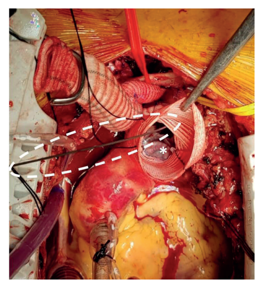
Figure 2 Intraoperative picture after TEVAR through the opened arch. The dotted line highlights the stiff guidewire through which the endoprosthesis (*) was anterogradely advanced to the DTA.

Completion angiography demonstrated appropriately reconstructed aortic arch, successful exclusion of the entry tear and rupture site, as well as adequate renal and visceral branches perfusion. The patient had an uneventful postoperative course, being discharged on postoperative day 23. A control CTA prior to discharge demonstrated successful arch reconstruction, true lumen expansion, patent visceral branches and no signs of complications (FIGURE 4).