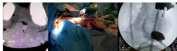
Image 2: CT angiogram of popliteal artery injury; External fixation of knee and pelvis; Intraoperative angiography with popliteal artery injury