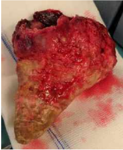
Figure 2 Large thrombus removed from the inside of the aneurysm with a conical shape