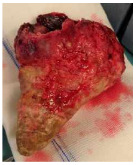
\it Figure 2 Large thrombus removed from the inside of the aneurysm with a conical shape