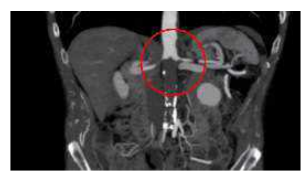
Figure 1 Coronal view of the pararenal aorta showing juxtarenal aortic thrombosis, with patent renal arteries (2018).

A CT-angio was requested and revealed juxtarenal aortic thrombosis without the involvement of the renal arteries (Figure 1), extending through the common and proximal external iliac arteries with heavily calcified walls. The femoro-popliteal and tibio-peroneal sectors did not present significant occlusive disease.