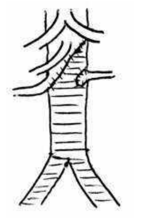
Figure 3 Schematic view of the proximal anastomosis involving the CT, SMA and RRA and reimplantation of the LRA in the graft.

Distally, the graft was an astomosed to the common femoral arteries.