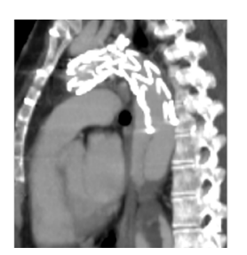
Figure 1 CTA reconstruction at 1year of FU showed a new tear at the distal portion of the stentgraft with an insinuation of it into the false lumen

She was discharged one week later with no symptoms. During follow-up, the 12 months CTA reveled a new tear at the distal portion of the stentgraft with a significant insinuation of this one into the false lumen and a proximal progression of the later (figure 1).