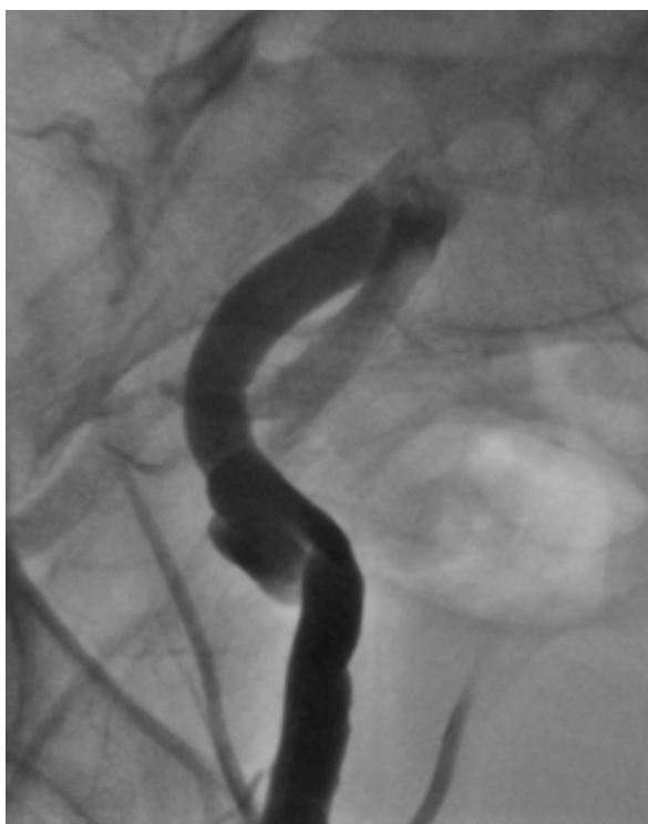
Figure 2 Initial angiography.

Evaluation of lumbar spine displayed slight degenerative changes. After retrograde right femoral puncture (6F), angioplasty with 9x40mm Complete® self-expandable stent was performed (Fig. 2 and 3).