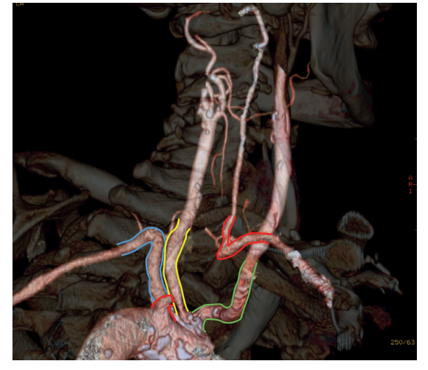
Figure 1 Pre-operative CTAngiogram, right back view. Red - right aberrant subclavian artery. Blue – Left subclavian artery. Yellow – Left common carotid artery. Green – Right common carotid artery.

he was fishing, activity that took most of his spare time and that he especially enjoyed. He had a previous history of peripheral arterial disease with an aorto-bi-femoral bypass 6 years before due to lower limbs rest pain and a stroke with complete recovery 2 months before. He was smoker for 40 years and diabetic for 12 years. An ischemic right coronary disease was present without indication for PCI or CABG. Radial pulses were present. Systolic pressures in the radial arteries measured by Doppler were asymmetric (right: < 35mmHg than left) and the right vertebral artery also had flow inversion in the Doppler ultrasound. CT angiogram showed a right aberrant subclavian artery occluded from the origin up to the retro-oesophagus (Figure 1). The left subclavian artery also had a 30% post-ostial stenosis. No stenosis was identified in the carotid arteries. The patient was on aspirin, ticagrelor, beta-blocker, statin and sitaqliptin/metformin.