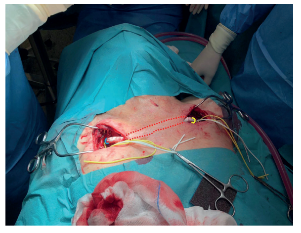
Figure 2 Intra-operative image. Blue – right axillary anastomosis. Red dotted – subcutaneous tunelization of 8mm ePTFE. Yellow – left axillary anastomosis.

Open treatment was proposed, due to the risk of subclavian-esophageal fistula if stenting was performed. The patient declined the carotid transposition of the right subclavian due to the stroke risk from the carotid cross-clamping. Therefore a hybrid procedure was idealized. First an 8mm ePTFE bypass from the left to right axillary arteries was completed; in the same operative time a retrograde approach of the left subclavian stenosis through the ePTFE graft was performed (Figure 2) and a balloon mounted 7x29mm stent was implanted in the left subclavian artery resolving the stenosis. The procedure was uneventful, and the patient discharged in the third post-operative day. Two weeks after discharge he was fishing without any limitation. Four months later the control CTAngiogram presented patent left subclavian artery stent and axillo-axillary ePTFE bypass (Figure 3).