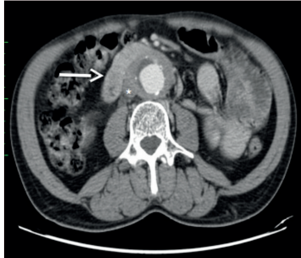
Fig. 2 In the IAAA there is inflammatory adhesions and the fibrosis to the adjacent structures. Note in the adhesion of duodenum (arrow) and the vena cava (star) to the aneurysm wall.