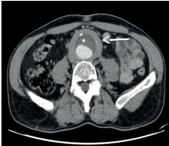
Fig. 1 Inflammatory abdominal aortic aneurysm (IAAA). There is an inflammatory halo around the aneurysm, characteristic of IAAA, which is known in the CT scan as "mantle sign" (arrow). Note the presence of thrombo (star) The inflammatory process occurs most prominently around the ventral and lateral walls of the aneurysm.

AAA is a focal and permanent dilatation of the aorta, with a diameter greater than 1.5 times the normal dimension of the aorta at the level of the renal arteries (1,2) . The normal size of the abdominal aorta varies with age, sex, race and body size, measuring on average 2 cm at the renal level. In this way, a practical working definition of AAA is an aorta with a diameter greater than 3 cm (2) . In IAAAs, the aorta is aneurysmatic and surrounded by inflammation, with stiffening of the adjacent tissues (Fig. 1) 1 . There is perianeurysmal fibrosis and inflammatory adhesions entrapping the surrounding structures 1,2,3 . The structures involved in the inflammatory process are duodenum (97-100%), inferior vena cava (63-70%), left renal vein (48-51%), ureters (20-44%), small bowel (20%), and sigmoid colon (5-20%) (Fig. 2 and 3) (3) .