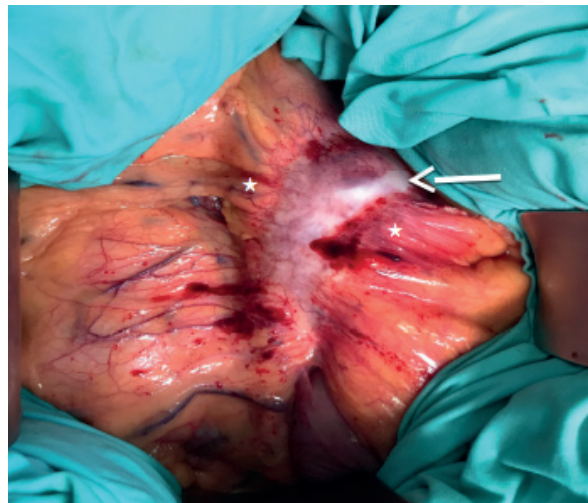
Fig. 3 Intraoperative image of an IAAA. It is notorious the bowel adhesion to the periaortic wall (stars). In the IAAA there is a retroperitoneal inflammatory reaction, with a shiny, white periaortic and retroperitoneal tissue (arrow).