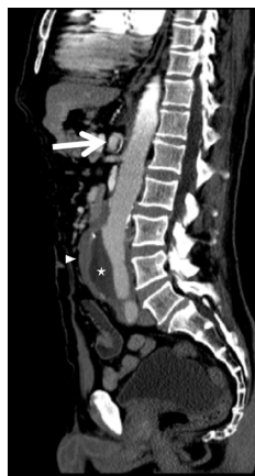
Fig. 5 A CT scan of an IAAA: thrombi (star) and inflammatory halo around the anterior wall of aneurysm, sparing the posterior wall (small arrow). There is concomitant a celiac artery aneurysm, which does not have inflammatory characteristics (large arrow).

Arterial hypertension, coronary artery disease, arterial occlusive disease are frequent comorbidities associated with both IAAA and non-IAAA (3) .