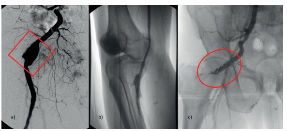
Figure 6 Conventional angiography images

Post-contrast, arterial phase enhanced, axial CT image at an ischiatic plane, demonstrating a 4,3cm partially thrombosed aneurysm in the right PSA (oval). Left PSA is also visible (square).