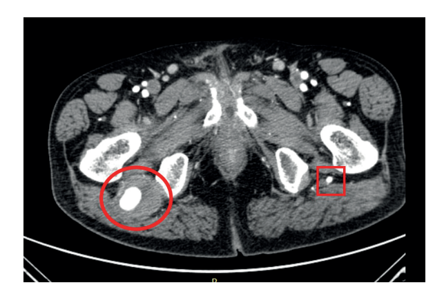
Figure 4 CT angiography

Post-contrast, arterial phase enhanced, axial CT image at an ischiatic plane, demonstrating a 4,3cm partially thrombosed aneurysm in the right PSA (oval). Left PSA is also visible (square).