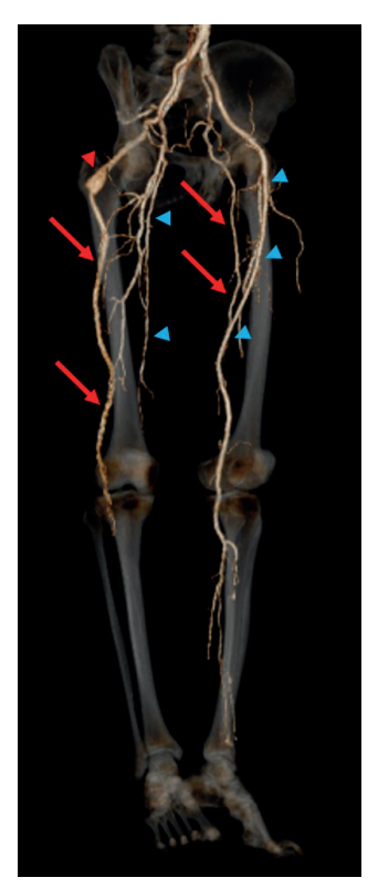
Figure 3 CT angiography

c) Sagittal oblique reconstruction of the left thigh illustrating an incomplete PSA (red arrows). Femoral artery (blue arrows) is fully developed and continues as popliteal artery (white arrow). No major communication is seen between PSA and the popliteal artery.